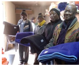
RAC Benoni Aurora also spread some winter warmth to the less privileged with their blanket project