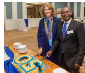
Cutting the cake