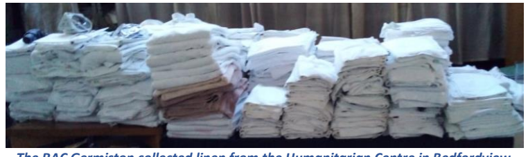
The RAC Germiston collected linen from the Humanitarian Centre in Bedfordview

Meanwhile, our Rotary Ann Clubs have been as busy as ever, particularly ensuring that the less fortunate in their communities are kept warm and fed during the cold winter months. But we have to bid a sad farewell to the Rotary Ann Clubs of Boksburg Lake and Johannesburg South and hope these ladies will stay active by linking with other clubs in their areas.