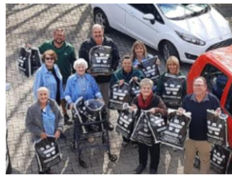
The RAC Riverside handed over R40 000 worth of new winter uniforms for learners at Handhawer Primary School in Vereeniging.