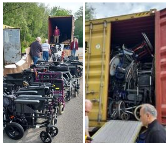
In total the club loaded two electric chairs, 277 mechanical chairs, 80 walkers and numerous zimmer frames, crutches and other spare parts