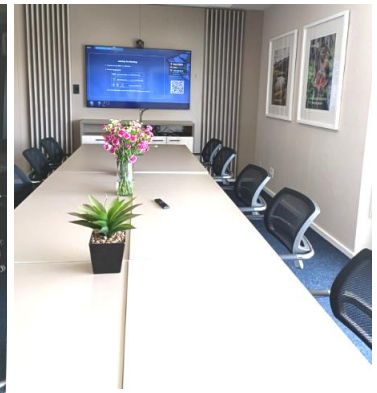
One of the meeting rooms at D9400 Headquarters