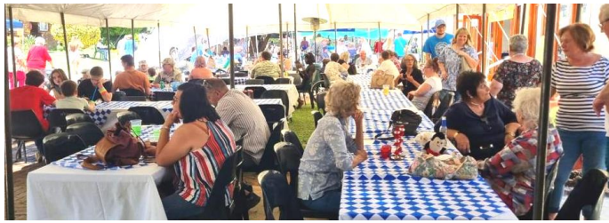
The RAC Pietersburg held a fete with Rotarians

Finally, it was Middelburg where again, we reconnected with old Rotary friends. Here there are 15 Rotary Anns but most of them are unable to attend meetings, which of necessity take place during early evenings. However, they are very active with knitting beanies and other items, and involved with further projects, including the Middelburg Care Village, along with the Rotarians.