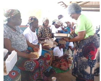
RC of Matola and the Anns club have a feeding scheme for the elderly