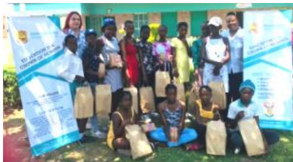
RAC Petersburg 100 and Steiner distributed sanitary towels to Romangoana Primary School, White River

This is another Ann club that has a strong connection with its Rotarians, working with them on all their projects. They took us to a day care centre for mentally disabled young people supported by Rotary and the RAC, where the dedicated care of the staff was touching to see. The children received Christmas gifts while the staff were given well-deserved hampers, which were happily received. Lively entertainment was provided by a Marimba band, which the children loved. In the evening we were treated to dinner with the Rotarians and Anns at a popular local restaurant.