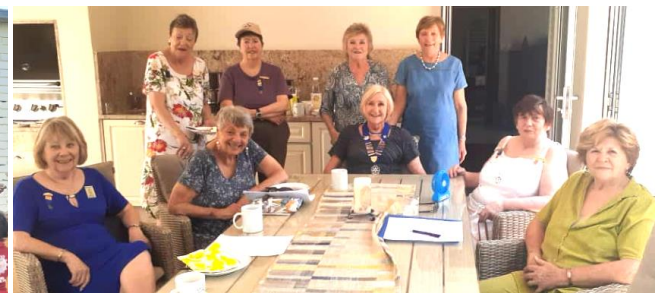
Visit to RAC Randburg