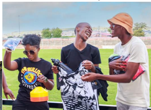
The donation included 32 complete soccer uniforms, 14 balls, 2 goal post nets, 2 first aid kits, socks, 40 cones, kit bags and various other items

Alex Black Poison was formed back in 2011 when, following the World Cup in South Africa, interest in and support for grassroots soccer was at its height. But over the years support has dwindled and the club has found itself scraping to cover its costs, as the young players pay no club fees.