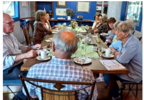
Riverside Anns at the Charity Shop and meeting at Kariba Ranch.

The Rotary Anns club of Rosebank visit was in conjunction with the DG's visit and, following our meeting, we joined the Rotarians for lunch at the Wanderers Club, where DG Koekie eloquently addressed us all. The Anns had just held their annual Bridge Drive, resurrected following COVID, and were able to raise over R24,000 for their various projects - too numerous to mention!