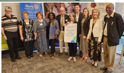
Past, present and future District Governors of D9400 celebrated the event with our American visitors