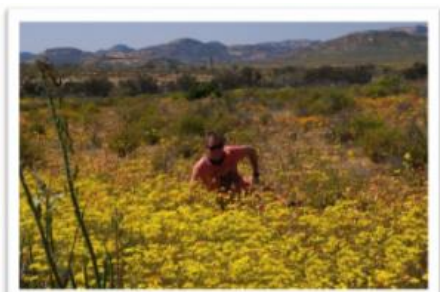
My own home-grown wildflower – Kevin.

And of course, I managed to finally get to go on holiday 4 x 4 style to the west coast. Timing could not have been better; with all the wonderful winter rains they have had the flowers were out in full Colour. I once again state that I am privileged to live in such a beautiful country.