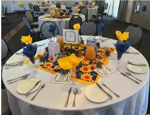
Beautiful table at the Ann Conference in honour of Ukraine