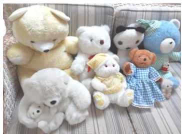
A donation of teddies for the Teddy Bear Clinic and traditional dresses – RAC Kyalami.