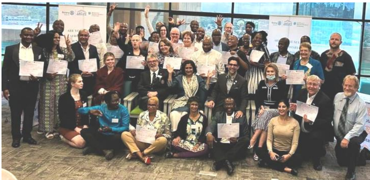
Congratulations to the 68 graduating Rotary Community Mediators (ARCoM)

ARCoM's Purpose: The pilot project aimed to establish mediation teams consisting of "Africa Rotary Community Mediators". Initially, the aim was to focus on Districts 9350, 9370, and 9400 first and then replicate the project further up Africa in region 28.