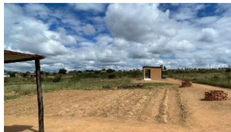
Setting up a garden project of the disabled – RAC Pietersburg 100