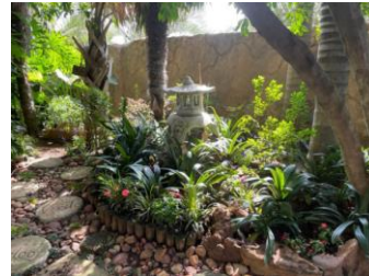
The Humble Bin Liner takes on a New Role