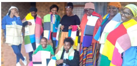
Collecting knitted squares for warm blankets. Daveyton Project

Hundreds of BEANIES are being knitted by various clubs in a huge effort for Operation Anti-Freeze. Springs Park received a donation of 250 last year, which were handed to the homeless and car guards, as well as to informal traders. They intend to continue with this effort for Mandela Day in July. Other beanies have been collected and passed on for despatch to Ukraine.