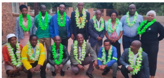
Fireside chat for RCC Forest Hill Ga-Mashishi