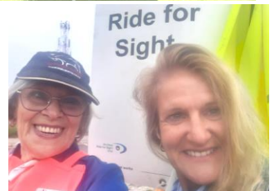
Dis-Chem Ride for Sight

RAC of Benoni Aurora also had eight ladies marshalling the Dis-Chem Ride for Sight cycling event on a very wet Sunday, 19 February.