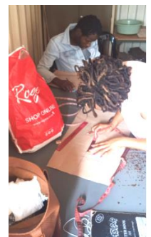
Youngsters learning new skills. Daveyton Project