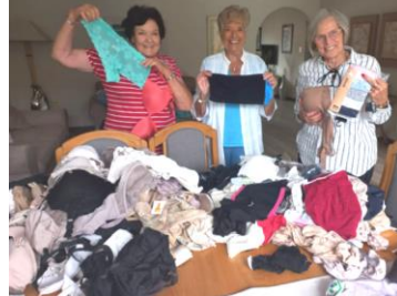
Undies for Inmates

The Rotary Anns of Benoni Aurora have been as busy as ever with the introduction of their Undies for Inmates Project, which supplies quality used and new underwear for inmates of the Johannesburg Women's prison. Many of these women have nothing, as theft of these items is a common occurrence when they are being dried after washing.