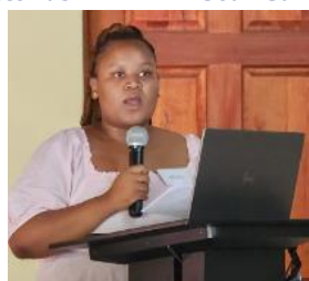
Wame delivered the current Rotaractors President's speech